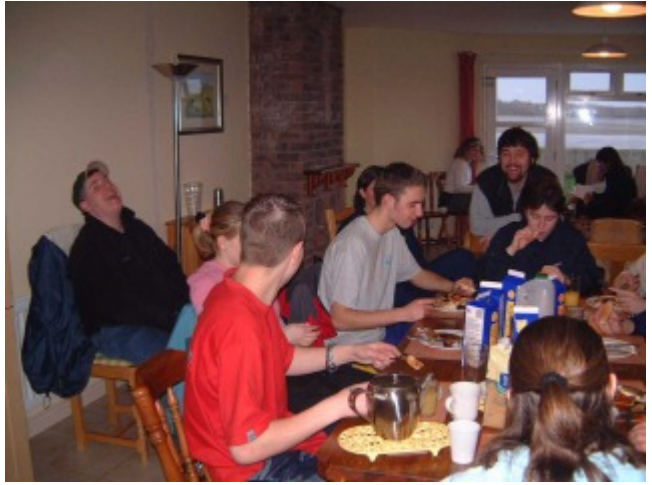
Jim, what is the joke?!