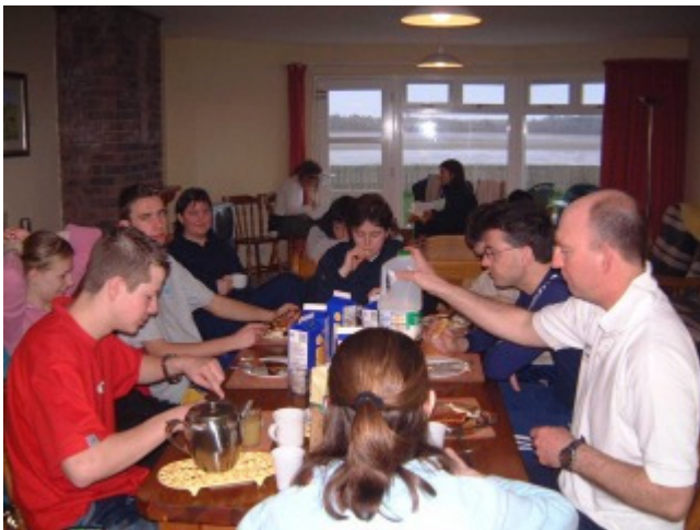
An ALT group who were doing their Canoe & Kayak Safety tests stayed in Dundrum with the Americans for a great time of fun, food and fellowship.